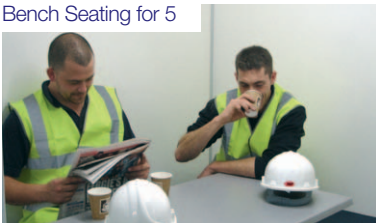
Bench Seating for 5

EasyCabin 12 gross weight 1800Kg unladen weight ONLY 1520Kg