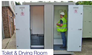
Toilet & Drying Room